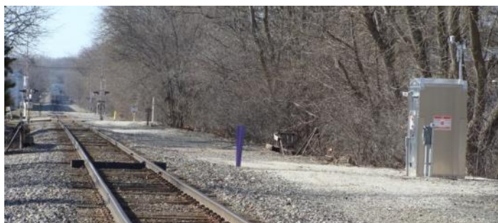
New hotbox detector at MP 118 in Oconomowoc, WI on Canadian Pacific.