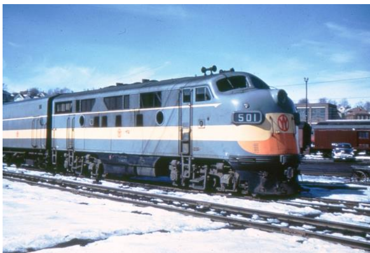
NYO&W F3 501 at Middletown, New York, date unknown.

Join us in person in the lower level of the North Shore Congregational Church at 7330 N Santa Monica Dr. in Fox Point. Doors open at 7pm for socializing and the program begins at 7:30pm. Or join via Zoom. Contact membership@nrhswis.org to receive notice of the meeting and the link to the meeting.