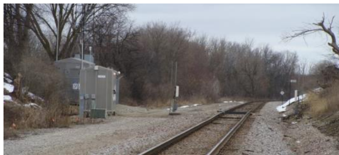
New hotbox detector at MP 123 in Ixonia WI on Canadian Pacific.