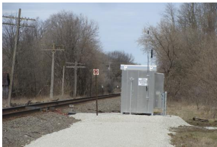
New hotbox detector at MP 83 in Mukwonago, WI on Canadian National.