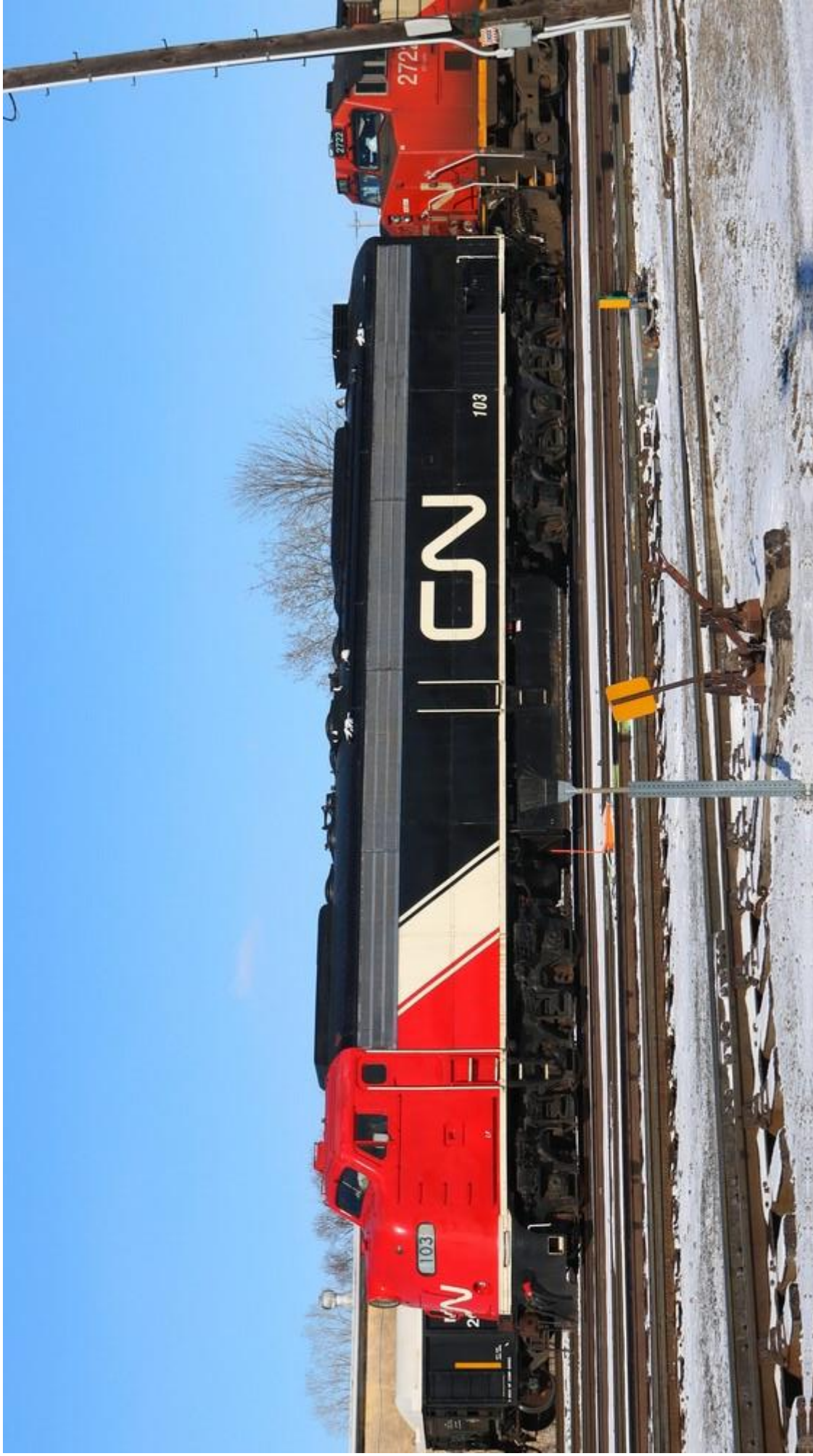
The CN #103 E9A sits in Neenah WI on 02-28-2024. The locomotive is on its way to the National Railroad Museum in Green Bay, WI. The CN donated the locomotive to the museum.