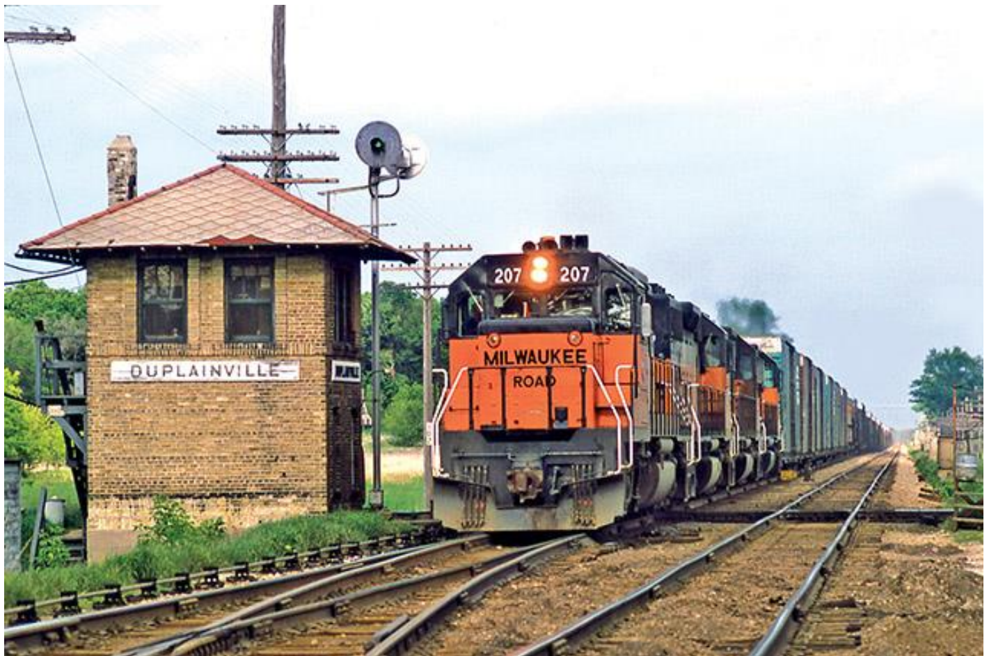
The Ford Fast passes the Duplainville Tower on July 7, 1975

Visit the Chapter Webpage www.nrhswis.org