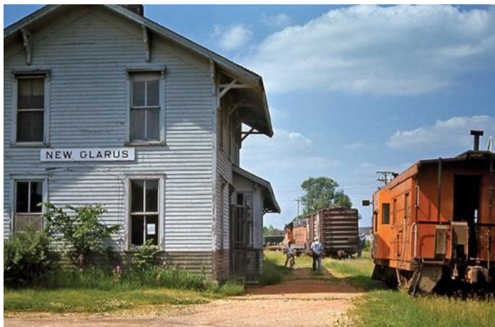
A rare shot of SD9 508 switching at the New Glarus depot in June, 1971.

"The retrenchment of the Milwaukee affected many cities and in several states. The electrification started decades earlier was deenergized. But no city suffered more than Milwaukee, once home for thousands of railroad employees. The Shops where freight and passenger cars were once built, were torn down. The massive yards of the Menominee Valley were lost, even the hump yard."