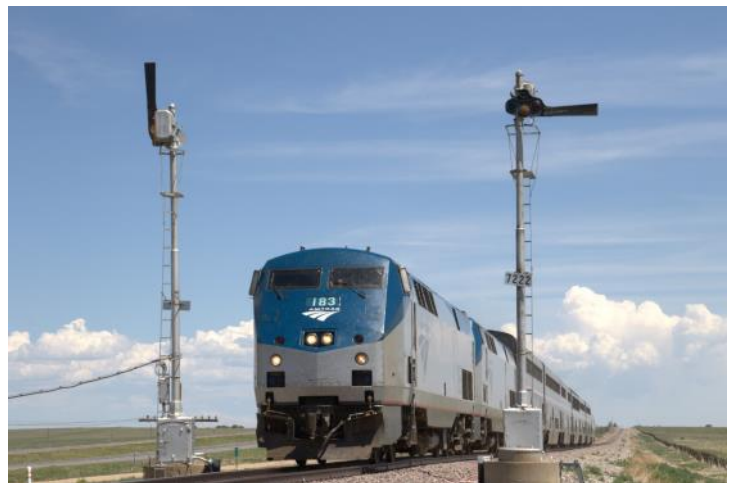
Semaphores and Amtrak in New Mexico

Winners will be announced in the November 2022 issue.