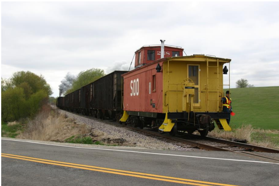
Protecting the Shove. Soo #1003 backs from Beaver Dam, WI to Randolph, WI to spend the night on April 23 2005.