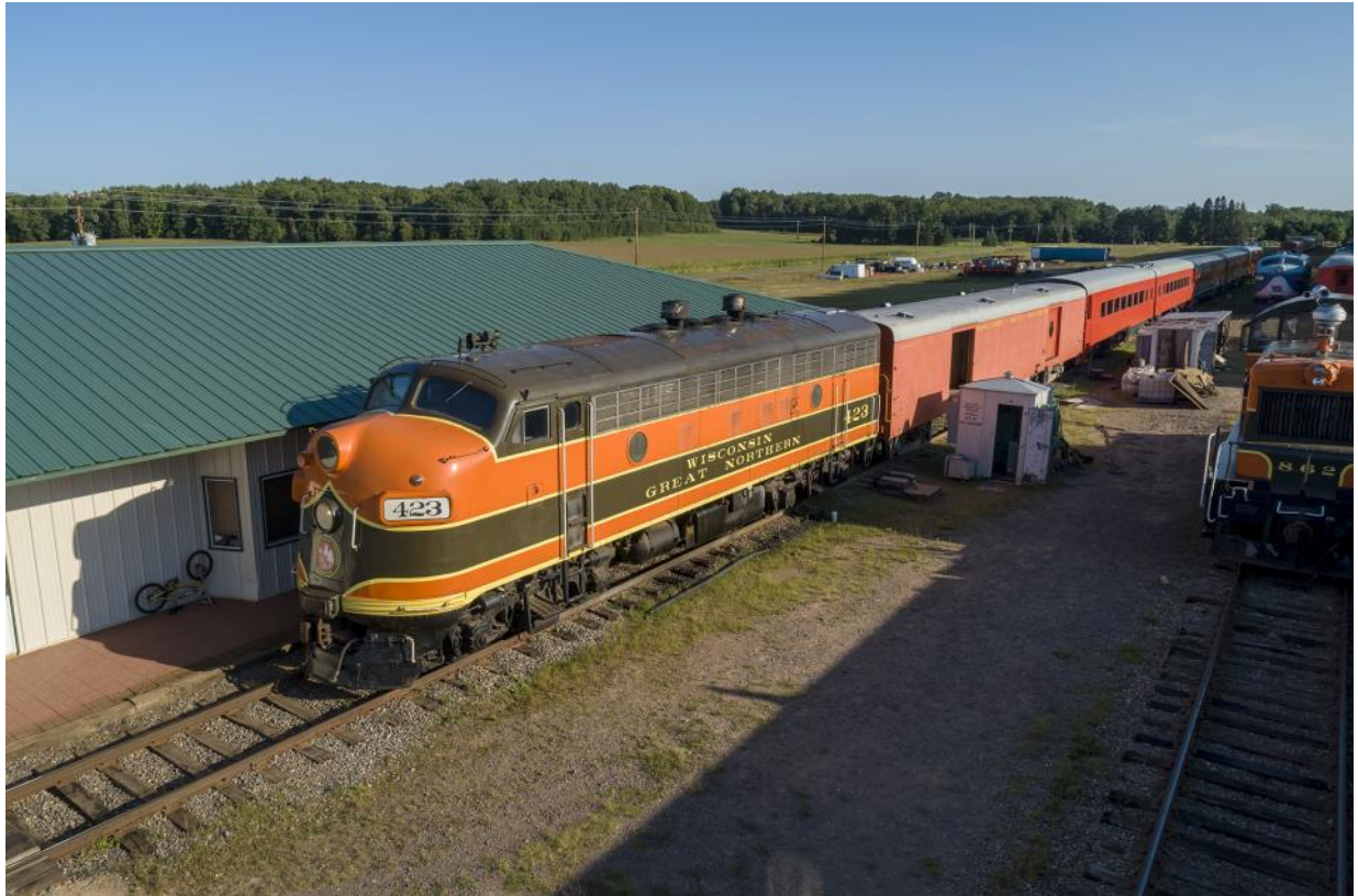
Wisconsin Great Northern's dinner train has boarded passengers and dinner service has begun. Train is about to depart the Trego depot. The railroad runs passenger excursions five nights per week, year-round. August 30, 2018.