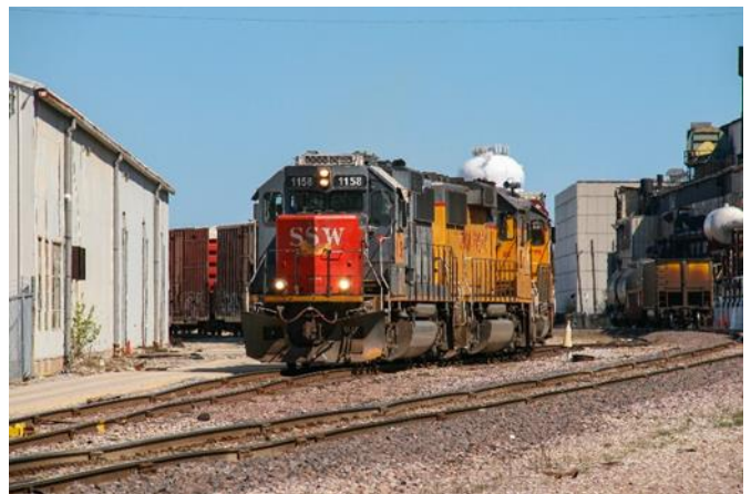
UP GP60 No. 1158, still wearing its original St. Louis Southwestern (SSW) lettering and Southern Pacific “Bloody Nose” livery, leads train LBU51B while making a set out at Cudahy, Wis. on May 3, 2020. SP was acquired by UP in 1996.