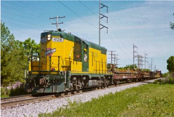
Prior to the merger with the UP the Chicago & Northwestern operated the Cudahy Job to serve customers in Cudahy and South Milwaukee. C&NW GP7 No. 4128 is approaching St. Francis on the Kenosha Sub. with the Cudahy Job on June 9, 1994

The jobs that were eliminated include the LPA54 (a.k.a. the “Cudahy Job”) from Butler; the LPK41 from Bain; the LPK42, LPK44 and YWK51 from Waukegan; the LPR49B between Proviso and Waukegan; and finally, the seasonal RIVUP rock trains between Ives (near Racine) and Upton, Ill.