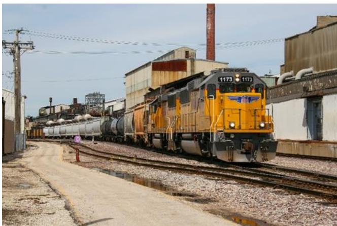
Union Pacific train LBU51 is southbound on the Kenosha Subdivision in Cudahy, Wis. at Whitnall Ave on May 1, 2020. A pair of GP60s has been the usual power for these new trains.

To replace the trains that were abolished, a new pair of trains was created. Operating six days per week trains LBU51 and LBU51B go on duty at Butler Yard in the morning. After departing from Butler, they have typically operated south on the Kenosha Sub. to Kenosha, across the Farm Industrial Lead to Bain and then down the Milwaukee Sub. to Proviso Yard, working various locations along the way. They are run as LBU51 on Monday, Wednesday and Friday, and as LBU51B on Sunday, Tuesday and Thursday. Also operating six days per week, trains LPR50 and LPR50B go on duty at Proviso in the morning. These trains usually stay on the Milwaukee Sub. but will occasionally run via Waukegan on the Kenosha Sub. They are operated as LPR50 on Sunday, Tuesday and Thursday, and as LPR50B on Monday, Wednesday and Friday