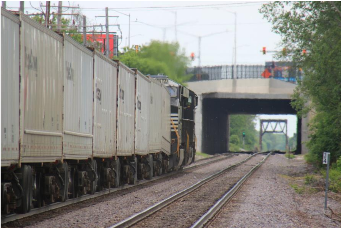
In June 2014 Roadrailer Train ZEMCH is eastbound from Butler to Chicago. About to pass under Hwy 100 and Bluemound Road. The roadrailers don't run anymore. Trains use a different bridge than the classic down the tracks now.