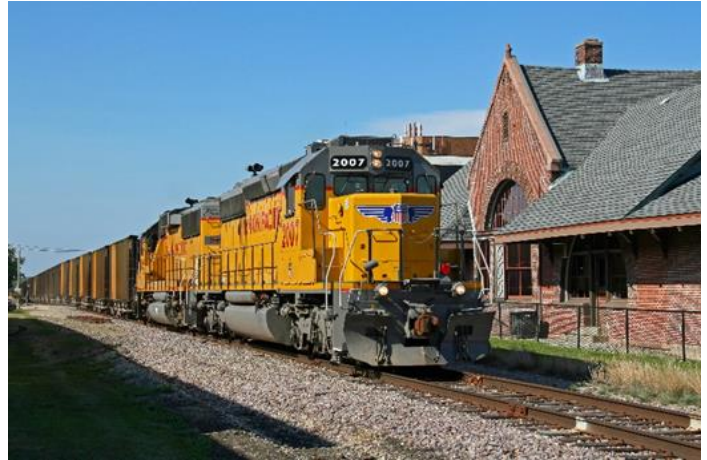
UP SD40N No. 2007 leads train RIVUP past the South Milwaukee depot on the Kenosha Sub. on August 18, 2016. The RIVUP would move crushed stone for Vulcan Materials from the quarry at Ives on the Kenosha Sub. to a distribution facility at Upton on the Milwaukee Sub.

To replace the trains that were abolished, a new pair of trains was created. Operating six days per week trains LBU51 and LBU51B go on duty at Butler Yard in the morning. After departing from Butler, they have typically operated south on the Kenosha Sub. to Kenosha, across the Farm Industrial Lead to Bain and then down the Milwaukee Sub. to Proviso Yard, working various locations along the way. They are run as LBU51 on Monday, Wednesday and Friday, and as LBU51B on Sunday, Tuesday and Thursday. Also operating six days per week, trains LPR50 and LPR50B go on duty at Proviso in the morning. These trains usually stay on the Milwaukee Sub. but will occasionally run via Waukegan on the Kenosha Sub. They are operated as LPR50 on Sunday, Tuesday and Thursday, and as LPR50B on Monday, Wednesday and Friday