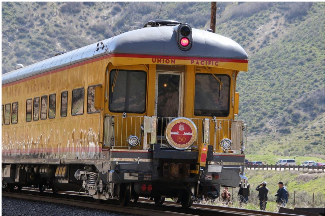
Special Drumhead on the Observation Car on the UP steam train headed back to Cheyenne, WY from Ogden, UT and the 150th Anniversary of the Golden Spike in May 2019