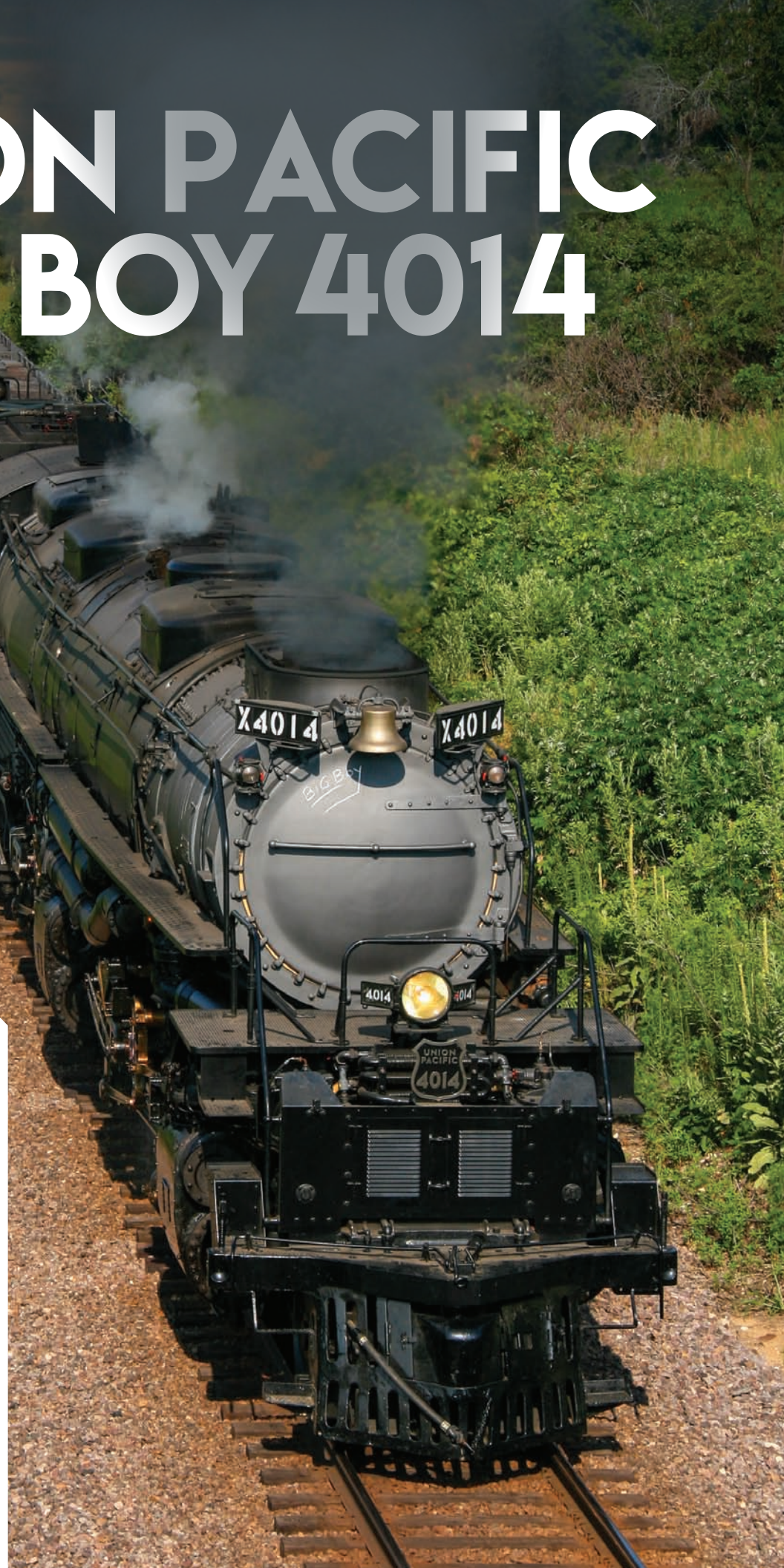
West of Glen Oak, WI, 10th Road Bridge

Here are some photos from Wisconsin Chapter NRHS members of the Big Boy as it visited our area.