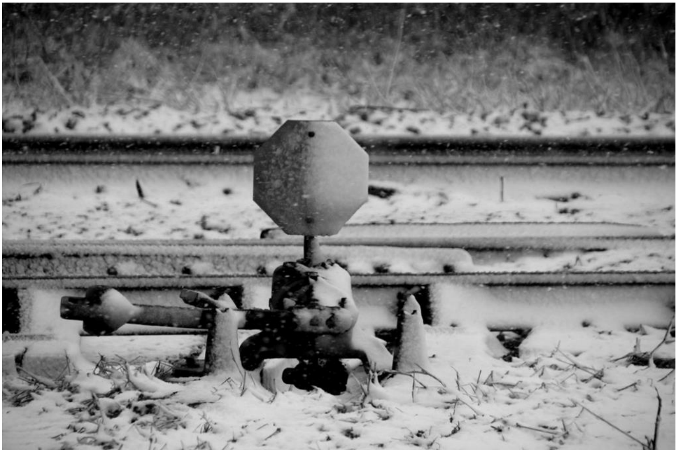
A switchstand show an accumulation of snow from an April 14, 2019 snowstorm.