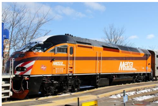
Newly Painted METRA Units in Elgin, IL January 13 2019