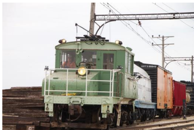
TMER&L #L4 in action in 2014 at IRM