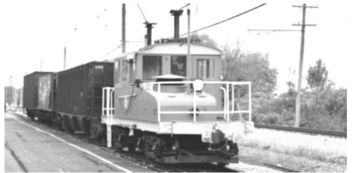
An L locomotive and hoppers will be staged for