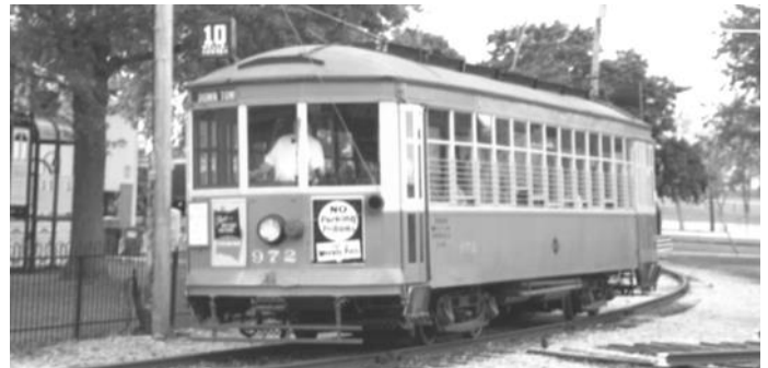
972 will run