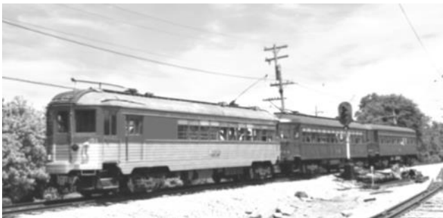
A NSL standard train will run