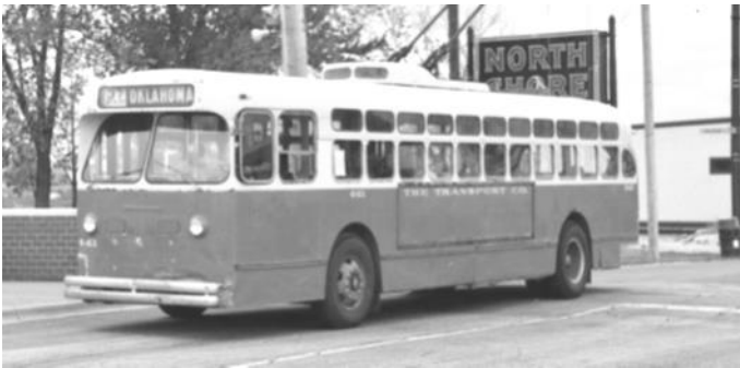
M&ST trackless trolley 441 will run

Plan on visiting IRM on Saturday October 13 for the SECOND Milwaukee Transit Day! This event will be similar to last year's but with two or more likely surprises. You will find a new entry point – the Schroeder Store, which is also our new gift store. AND IF the Electroliner has been reassembled, it will be on display and available for tours for the first time since 2013! DON'T MISS THIS SPECIAL EVENT!!!