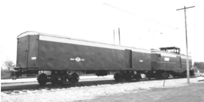
M15 will be out and running on the car line pulling the M37.