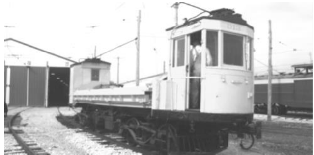
D13 will be running on the car line.

There will be a garage sale of bus related items, including some from Milwaukee. Hours: 10-6 Food Service will be available on site. Contact Tom at tssharratt@mwt.net or (608) 634-2118 for more information.