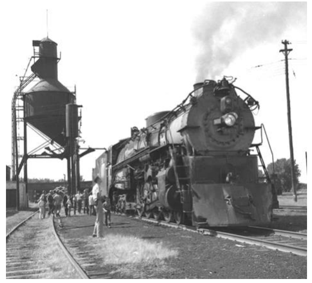
La Crosse WI CBQ #5632 No Date Given