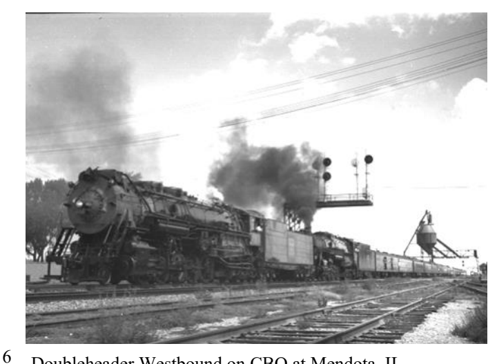
Doubleheader Westbound on CBQ at Mendota, IL