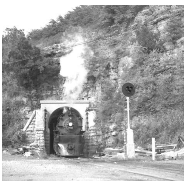
East Dubuque, IL CBQ #5632 No Date Given