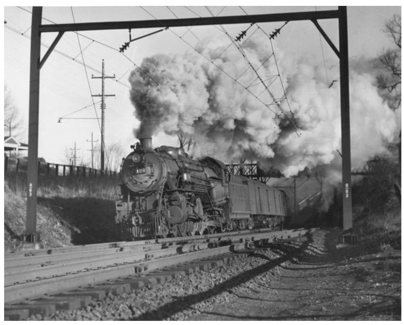
Reading 4-6-2 No. 128 is between Elkins Park and Oak Lane stations as it speeds south with a New York express in the 1940s.

Visit the Chapter Webpage www.nrhswis.org