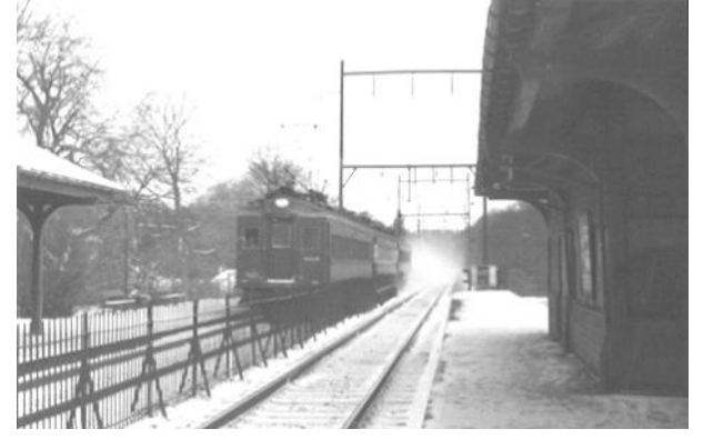
A Reading Company electric M.U. train kicks up snow at Elkins Park station in the early 1970s.