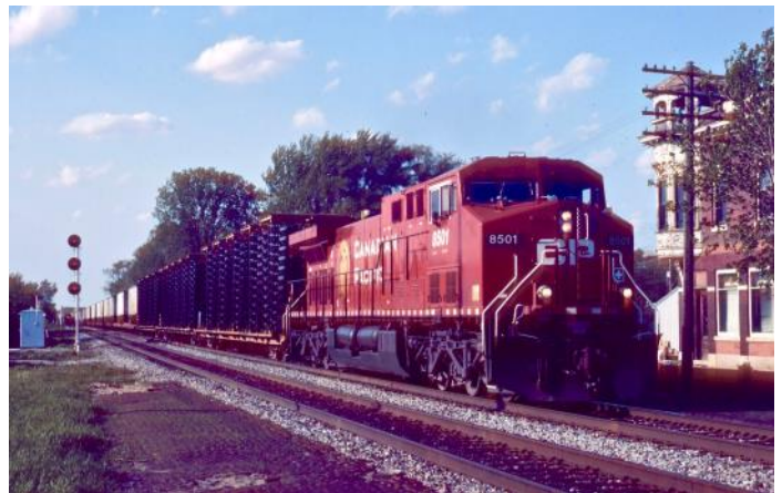
Above - Southbound at Sturtevant, WI