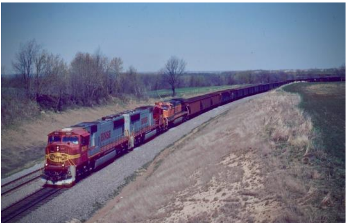
Below - Southbound on Byron Hill from Hwy F Overpass