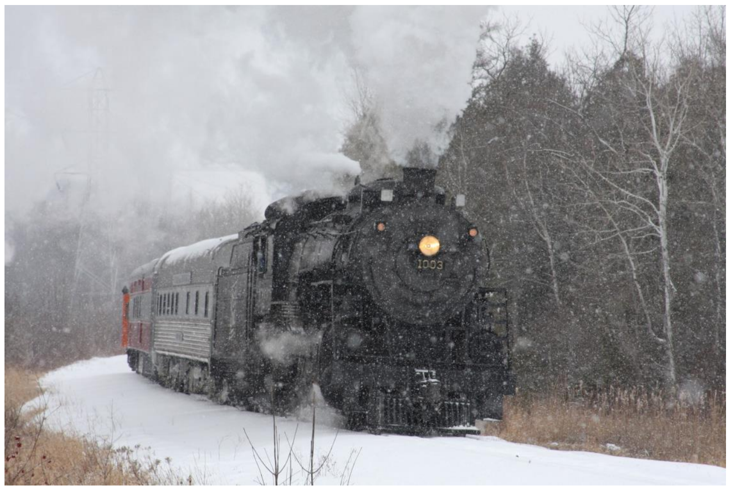
A snowy Soo #1003. In December 2007 the Soo #1003 pulled a Santa Train to Plymouth, WI. During to return trip to North Milwaukee a Lake Effect snowstorm kicked up. It made for some great winter steam train shots by Keith Schmidt

Visit the Chapter Webpage www.nrhswis.org