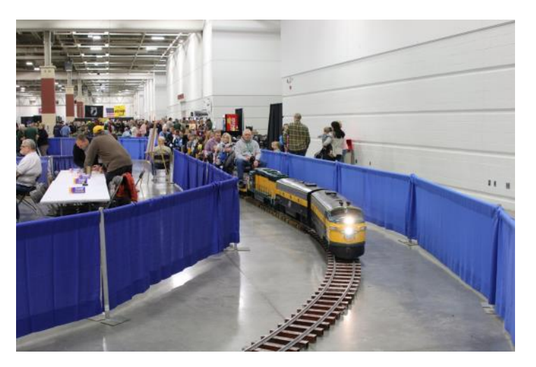
Railfanning at Trainfest. A CNW consist is about to roll by.