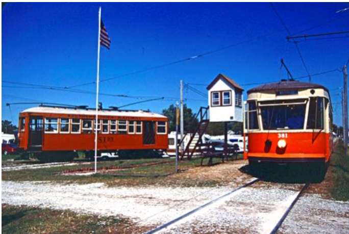
Southern Iowa Railway #9 and Waterloo Cedar Falls & Northern #381 at Midwest Electric Railway

lengthened by the SIRy to a two truck, four axle car with a baggage section. It is also the only operable Barber Car in existence. Waterloo Cedar Falls & Northern 381 was built for service in Knoxville, TN before ending all revenue trolley service in Iowa on August 31, 1958. The fun part of this day is the guests of the railroad get to operate the cars. It is a day that all in attendance enjoyed immensely.