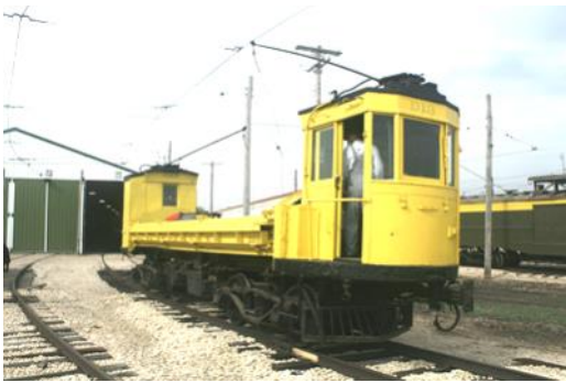
Milwaukee Traction Day at IRM by Dave Nelson