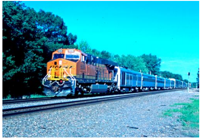
BNSF #5355 leads BNSF Employee Appreciation Special at Lytles west of North La Crosse, WI

On June 14th Dad and I were presented with tickets to ride the BNSF's Employee Appreciation special from La Crosse to Alma and return, a 99 mile, two hour trip. The fifteen car train had a new GE locomotive on each end to speed the return trip. Only seven of the cars were open to the riders. Six of these cars were former Southern Pacific bi-level commuter coaches that had been rebuilt for service on the defunct Transisco