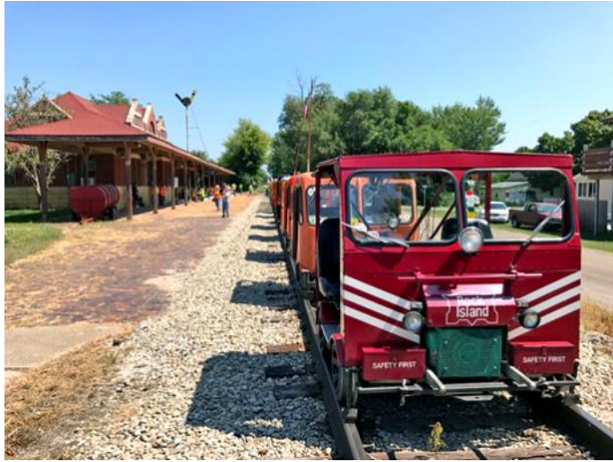
NARCOA group pauses for lunch at classic Burlington Cedar Rapids and Northern Depot in Vinton, IA August 19 2017

with other friends along for the day. About 40 motor cars in many different sizes and shapes partook of the day. I rode in a car built for the MoPac and currently painted with a feathered WP emblem. Dad had the pleasure of riding in a former Milwaukee Road car with a full Tomah cab. The group did not depart Vinton until the IANR's northbound freight passed through at 10:15. We headed south to the north side of Cedar Rapids where we turned around at the Cedar River bridge. Just to the south of the IANR's ex-Rock Island bridge over the river are the pillars for the abandoned Milwaukee Road Iowa Divi-