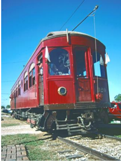
C&AE Car #320 at Midwest Electric Railway.

To start the summer on June 10 Dad and I joined a group of railfans to ride the Midwest Electric Railway in Mt. Pleasant, IA. Between the two of us we have over 30 years of combined