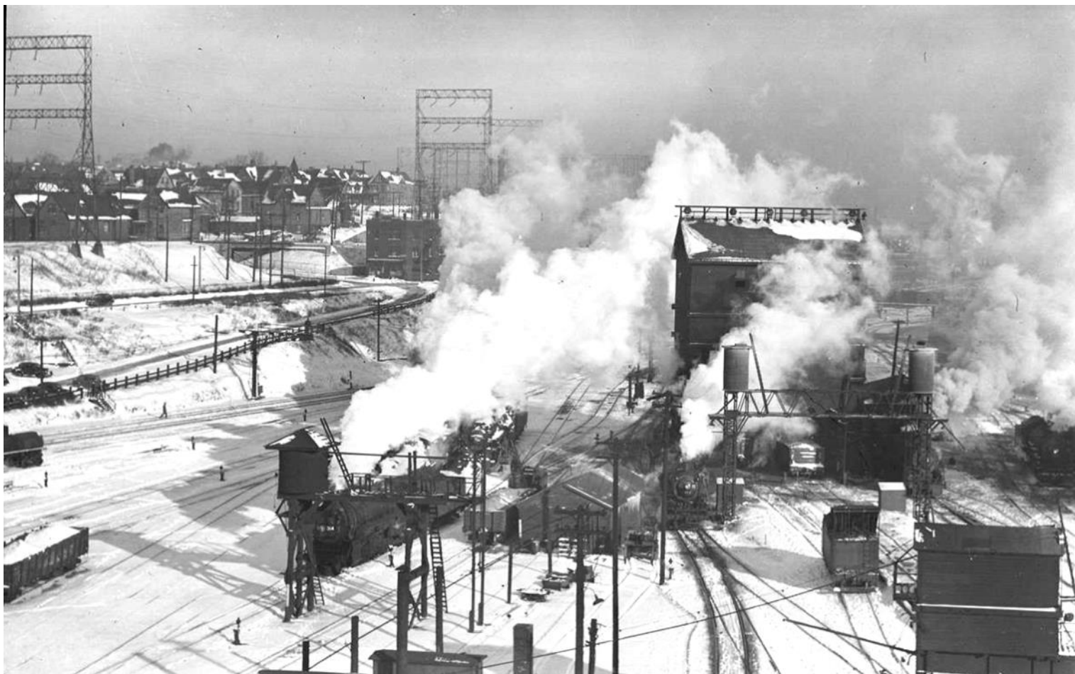
A Cold Day in Milwaukee as Milwaukee Road steam locomotives wait for service and coal. Also seen in the background is the TMERL&Co right of way. No Interstate yet. Photo is not dated.

Visit the Chapter Webpage www.nrhswis.org