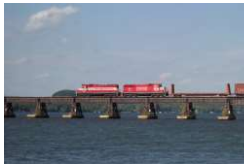
WSOR train crosses the Merrimac Bridge in August 2004