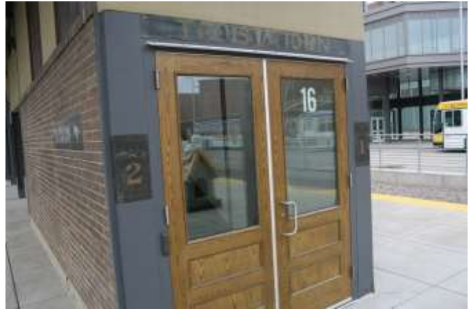
Old Entrance to Train Shed