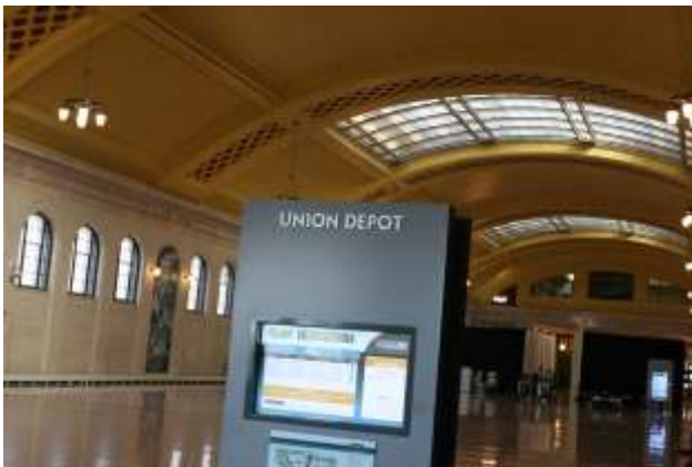
Portion of the Main Concourse in the Depot with skylights that had been covered up in World War II