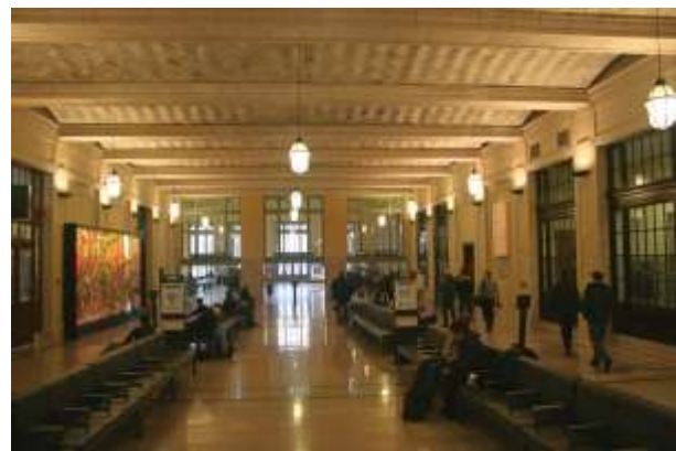
Main Waiting area of the St Paul Depot