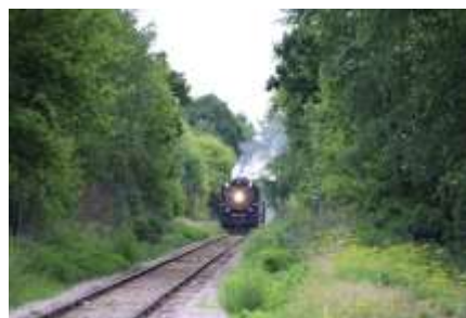
NKP #765 rolls at 10 mph on WSOR track at Walworth, WI June 2016

Since 1994, the state's department of transportation has provided more than $225 million in railroad grants and more than $127 million in rail infrastructure loans.