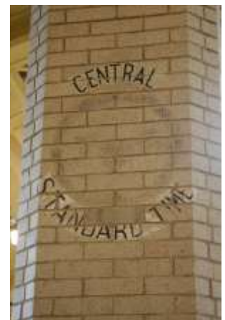
Remnants of By Gone Days at St Paul Union Depot