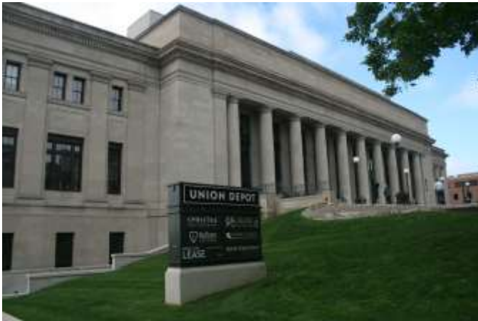
St Paul Union Depot Neo-Classical Exterior