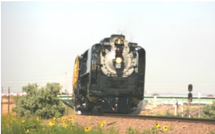
UP #844 departs Cheyenne, WY eastbound in July 2005