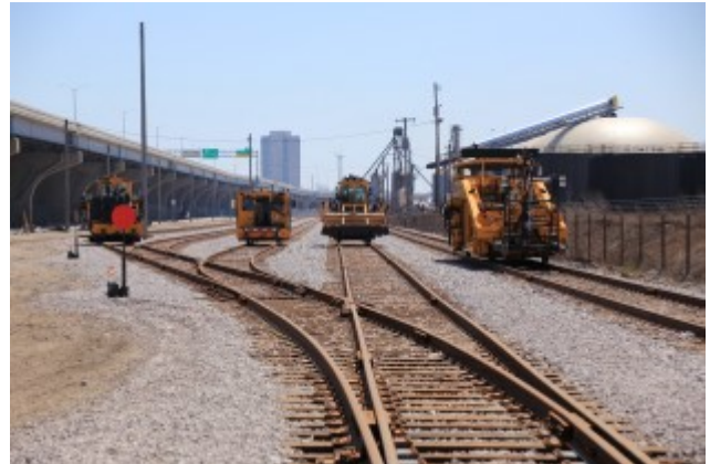
New Yard tracks at Milwaukee Harbor April 17, 2016.

Over the past several months track crews have been busy down at Milwaukee’s harbor, Jones Island. The five track yard on the east side of the harbor has been completely replaced with new rail, switches and ballast. It looks very nice. There have also been some other track replacements done in the same area. Hopefully this is a sign of the island seeing some increased rail traffic. The track on Jones Island is owned by the City of Milwaukee and the Harbor Commission and is used by both the Union Pacific and Canadian Pacific railroads. The Union Pacific Marsh Job is pretty much a daily visitor to Jones Island during the week. The CP visits as needed.