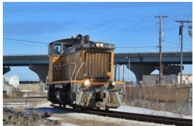
UP switcher on the connection track on Jones Island June 2010