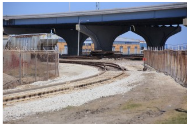
Some new rail laid on the track connecting the east and west sides of the harbor.