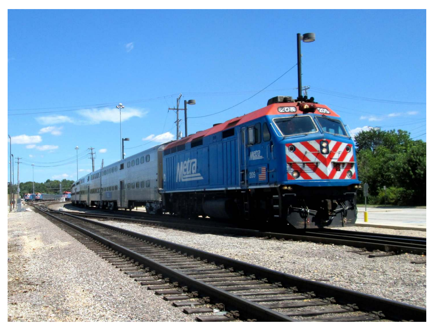
Metra #205 an F40-PHM nicknamed a "Winnebago" leads a METRA train. This train and many like it can be seen and ridden using the Metra Trips guide included in this issue.

Visit the Chapter Webpage www.nrhswis.org